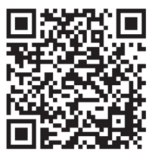
(OECD 經濟合作與發展組織)

作為財務機構，信安信託(亞洲)有限公司不獲允許提供稅務或法律意見。若您對您的稅務居民身份存有任何疑問，請詢問專業稅務顧問或瀏覽 OECD ( http://www.oecd.org/tax/automatic-exchange/crs-implementation-and-assistance/ ) 及 稅務局 ( http://www.ird.gov.hk/eng/tax/dta_aeoi.htm ) 有關自動交換財務帳戶資料的網頁，或掃描此二維碼，以獲取更多共同匯報標準及相關資料。