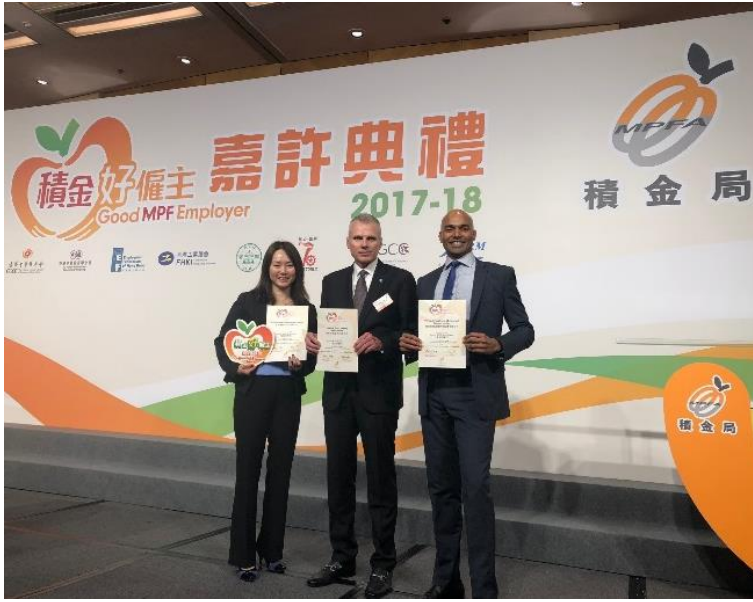
Caption: Senior executives of Principal Hong Kong received the “Good MPF Employer Award 2017-18” at the award ceremony on 9 October 2018.